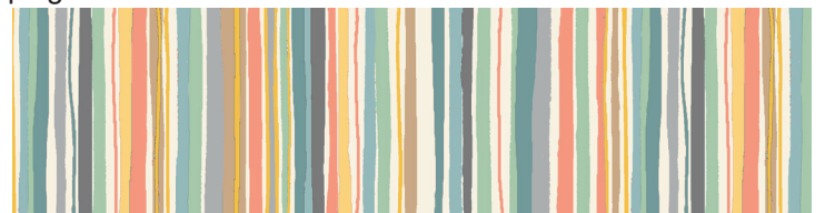
1899/P2 wavy Stripe