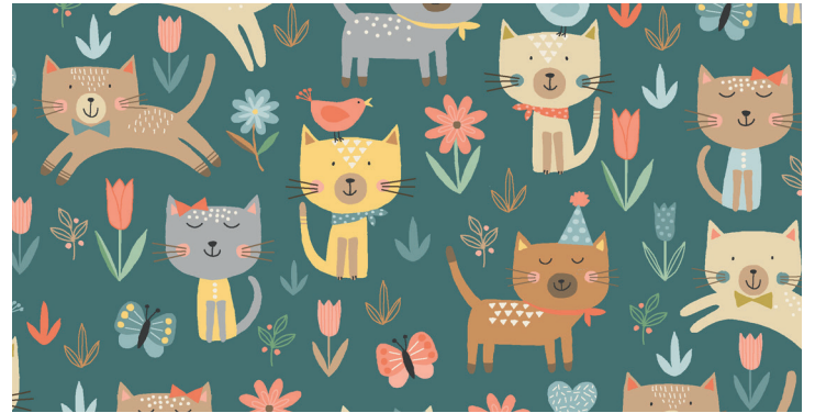
2183/T Jumping Cats