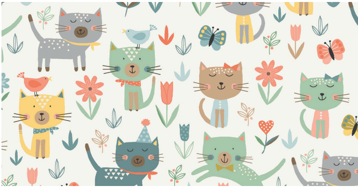
2183/Q Jumping Cats