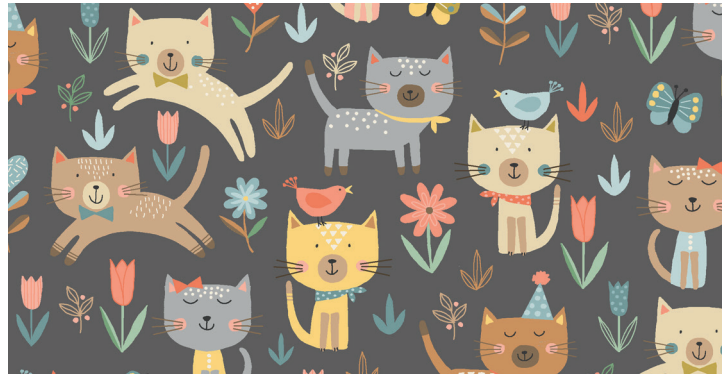
2183/S Jumping Cats